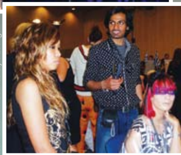
Team India from Bounce Style Lounge

India was represented at the International Trend Vision in Barcelona in 2007 by Bounce Style Lounge from Chennai.